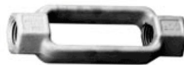
Sizes 3/8" to 1 3/4"