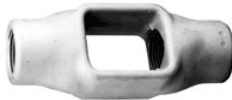
Sizes 1 7/8" to 4 1/2"