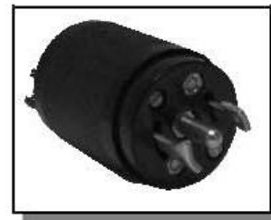
NELSON 2-WIRE (M)